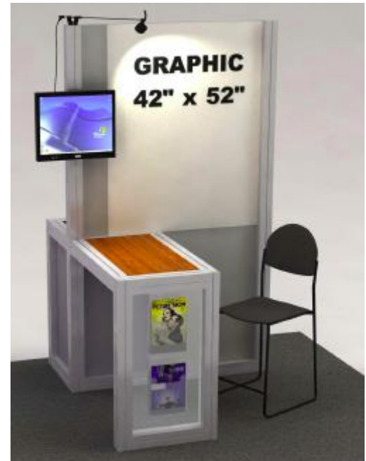
Pod exhibit rendering