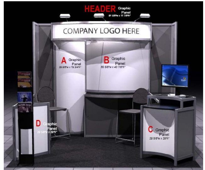
Ruby Turnkey exhibit rendering

* Exhibitor to provide artwork, SAP/ASUG to produce